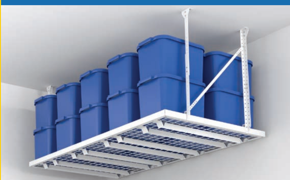
00199 Hammer-tone Finish